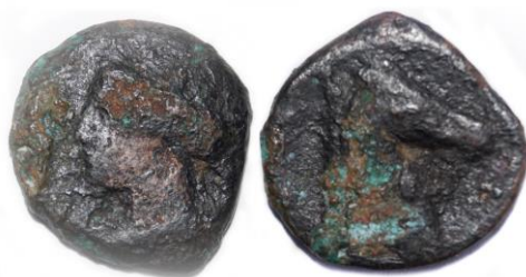
(Enlarged to show detail)

Refreshments will be available from the Easter Market on the Ground Floor where there will be a variety of stalls to also visit.